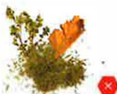
NO Green Waste