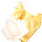
NO Loose Plastic Bags, Bagged Recyclables or Film Empty recyclables directly into your bin.