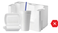
NO Foam Cups, Containers or Straws