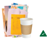
Paper & Paper Cups