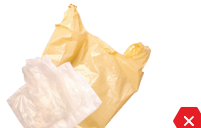
NO Loose Plastic Bags, Bagged Recyclables or Film Empty recyclables directly into your bin