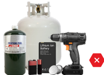
NO Batteries, Power Tools, Flammables or Hazardous Waste