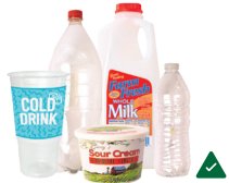
Plastic Bottles, Cups & Containers