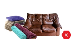
NO Clothing, Furniture or Carpet